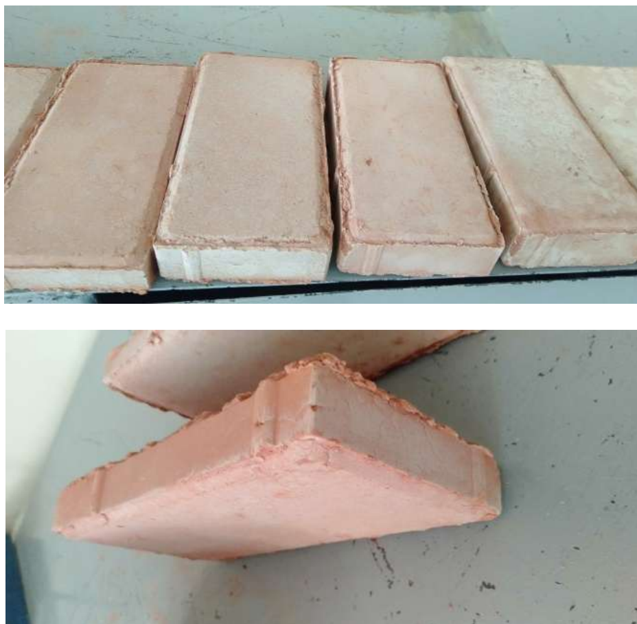
Figure 2. view of road surfaces that have undergone annealing

When applying ceramic compositions in the range of 900-1000°C, there is a significant increase in strength indicators, and the maximum strength in the specified temperature range was achieved by a ceramic composition with a suspension and is 9.4-12.5 MPA. This powder is 9% more than the composition with bentonite.