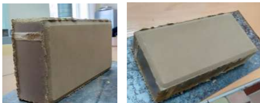
Figure 1. Ceramic samples in drying condition

The first thing I did was mold Shagan clay without additives (Figure 1). I compared the results obtained from it with products with added additives.